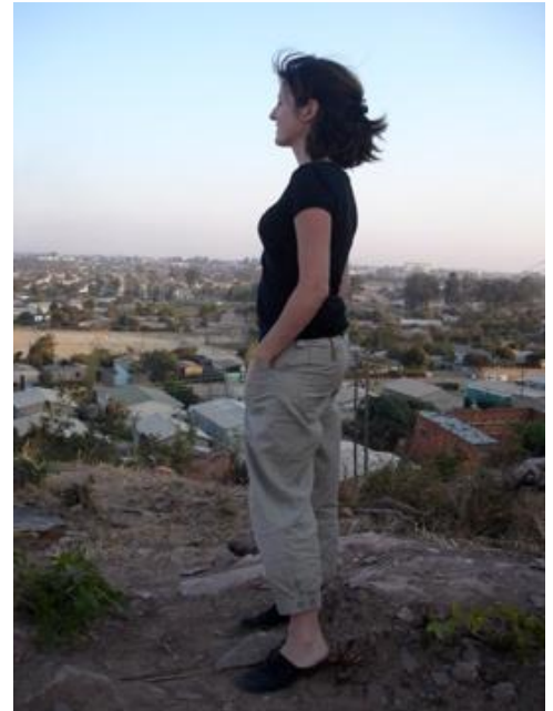
Prayer over the city of Lusaka